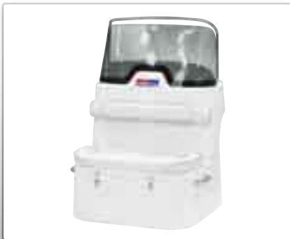
Center Console S-7 with locker under the seat (standard)