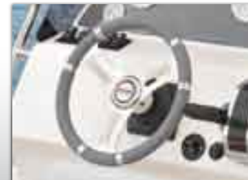
Hydraulic steering (optional)