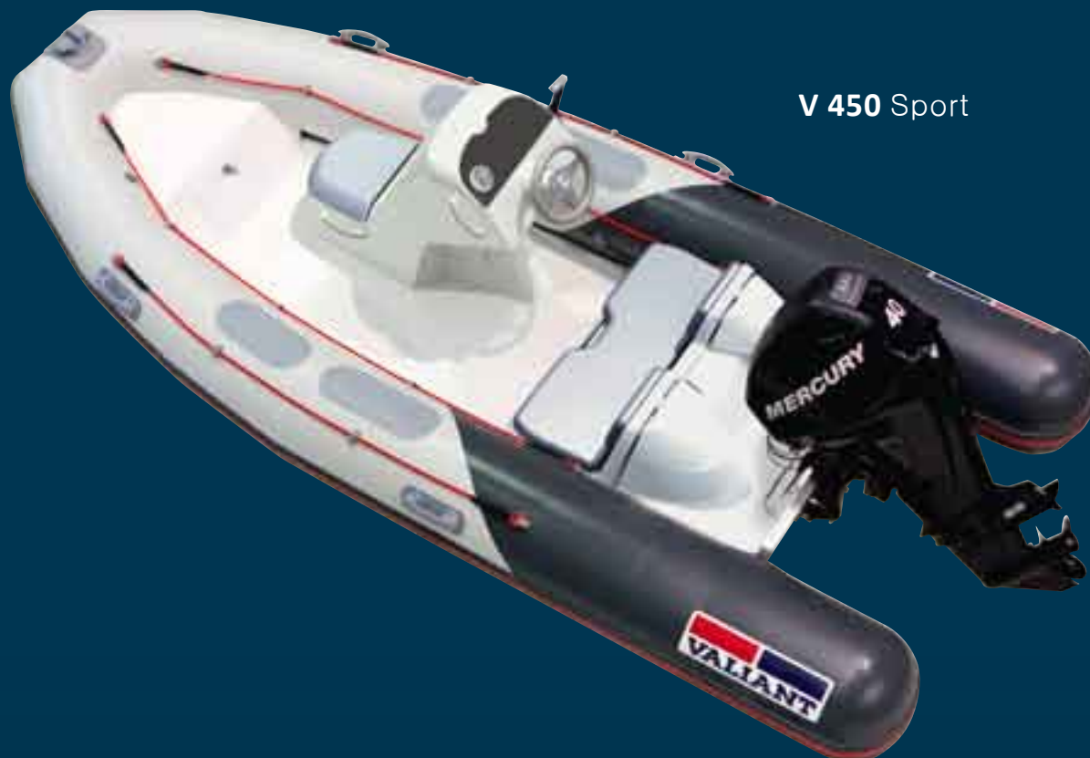
New center console S-4 (standard)