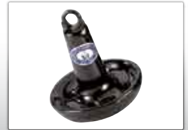
Mooring anchor for small inflatables