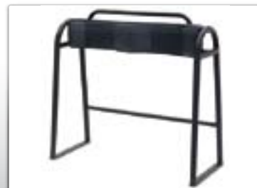
Backrest PT-6D without seat (two persons) Dim. (cm) : L: 104 x w: 42 x h: 104