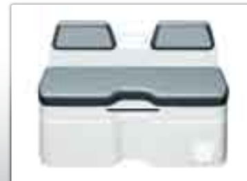
Seat with locker S-4 Dim. (cm) : L: 101 x w: 96 x h: 63