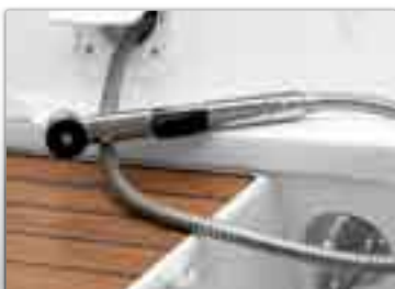
Electrical shower with tank 40 litres