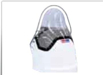
Center console S-6 Dim. (cm) : L: 67 x w: 95 x h: 157