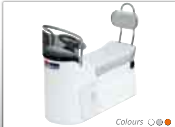
Double Jockey console S-5 with steering wheel (DR range) Dim. (cm) : L: 125 x w: 54 x h: 105