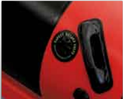
Pressure relief valves