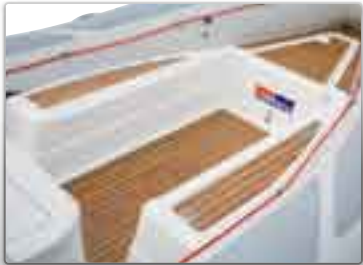
Bow side lockers for V750 Sport