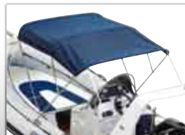
Bimini sunshade (various models available)