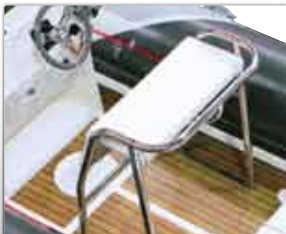
Leaning Post stainless steel, 2 persons (standard)