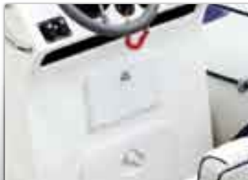
Glove box in ABS, for mounting (optional)