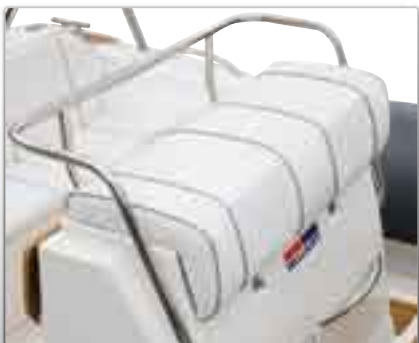
Leaning Post S-7D with locker (standard)