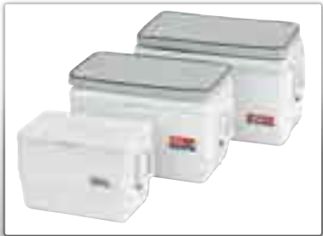
Marine ice chest (various models available)