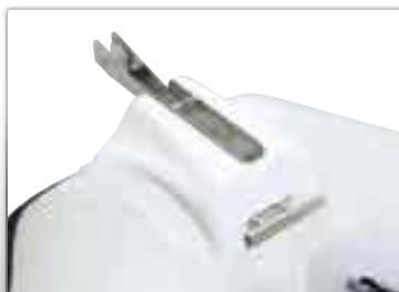
Retractable bow roller