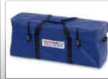
Sundeck storage bag