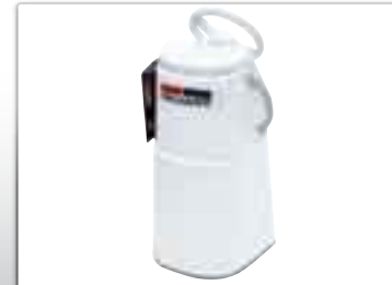
Center console S-3 Dim. (cm) : L: 33 x w: 38 x h: 75