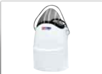
Center console S-5 Dim. (cm) : L: 54 x w: 70 x h: 111