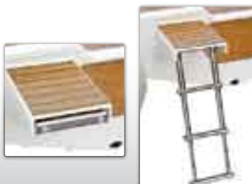
Stern platform with telescopic stainless steel bathing ladder S-5/7