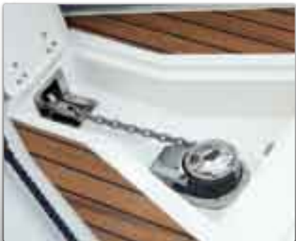
Electric windlass with anchor (optional)