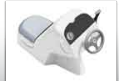
Center console S-4 Dim. (cm) : L: 107 x w: 46 x h: 97