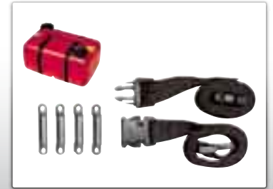
Fixing system for tank