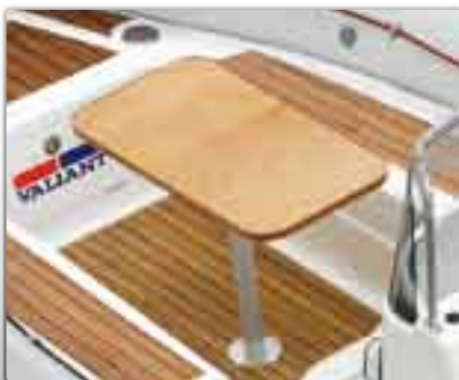
Front removable table on stainless steel foot (optional)