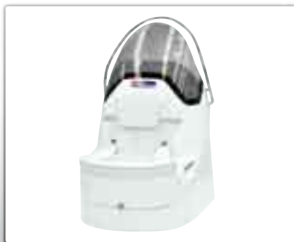
Center console S-6 Comfort with hydraulic steering (standard)