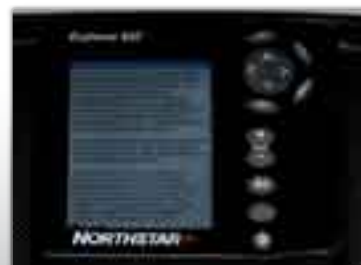
Northstar 657 combined sounder/GPS