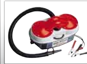
Electric pump (12V or 220V)