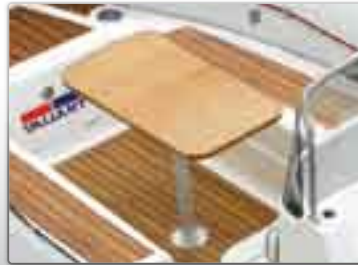
Front removable table on stainless steel foot (optional)