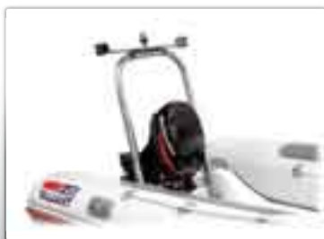
Folding navigation frame S-4 with navigation lights