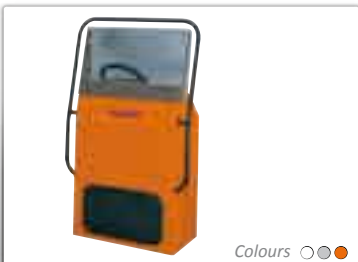
Center console PT-6 (DR range) Dim. (cm) : L: 43 x w: 77 x h: 151