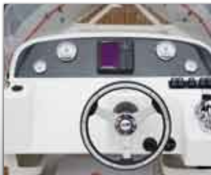
Dashboard with Northstar 657 combined sounder/GPS (standard)