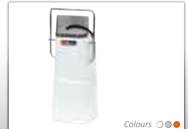
Center console PT-5 (DR range) Dim. (cm) : L: 42 x w: 46 x h: 112