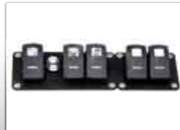
Electrical panel switches (depending on model)