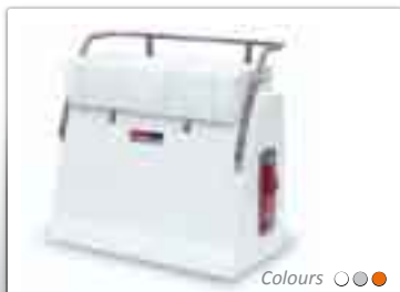
Leaning Post S-7D Dim. (cm) : L: 54 x w: 108 x h: 105