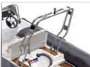
Folding navigation frame S-5/6/7 with navigation lights