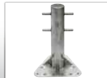
Stainless steel bow SAMSON post (for DR 620 and 750)