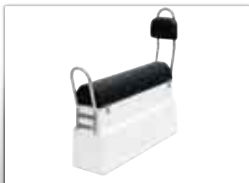
Double modular seat Dim. (cm) : L: 115 x w: 32 x h: 110