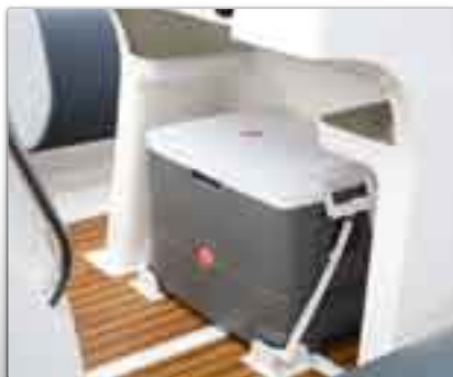
Ice chest marine with tie down kit (standard)