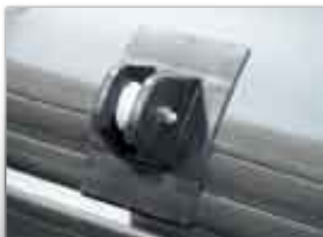
Rubber bow roller (grey or black)