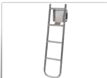
Stainless steel bathing ladder S-4