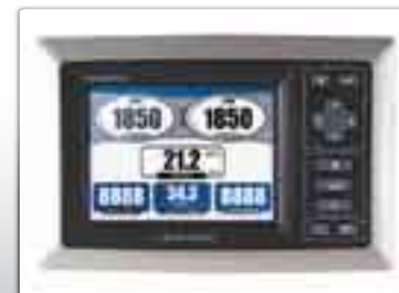
Vessel View (for Verado® engine only)