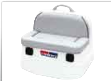
Seat with locker S-3 Dim. (cm) : L: 52 x w: 72 x h: 68