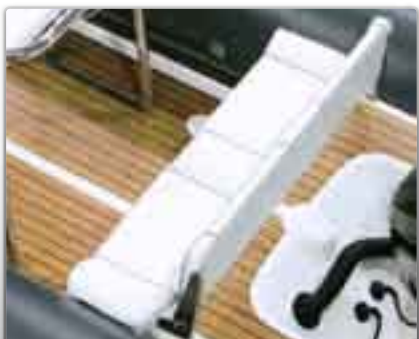
Stern seat, 3 persons (standard)