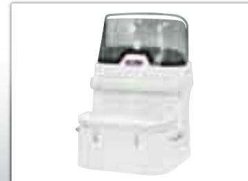
Center console S-7 Dim. (cm) : L: 83 x w: 112 x h: 150