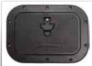
ABS hatch (different dimensions)