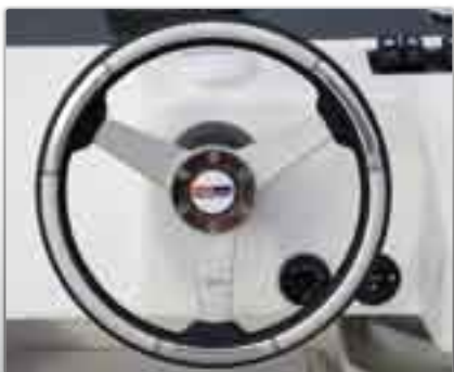
Steering wheel (standard)