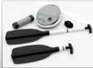
Standard equipment (pump, telescopic paddles and repair kit)