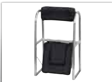
Backrest PT-7M with folding seat (one person) Dim. (cm) : L: 44 x w: 54 x h: 100