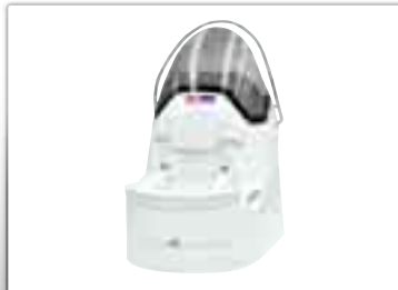
Center console S-6 Comfort Dim. (cm) : L: 108 x w: 95 x h: 157