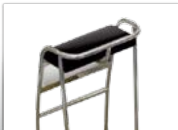
Leaning Post S-6D Dim. (cm) : L: 90 x w: 53 x h: 100