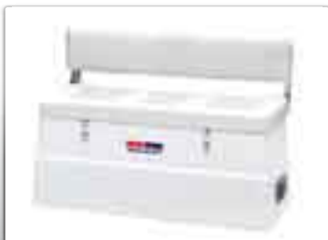
Seat with locker S-6 Dim. (cm) : L: 52 x w: 125 x h: 86