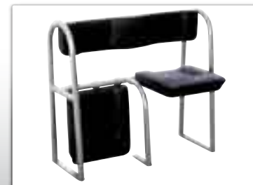
Backrest PT-7D with folding seats (two persons) Dim. (cm) : L: 42 x w: 104 x h: 105