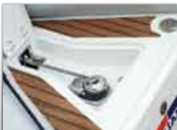
Electric windlass with anchor (on 750 Cruiser only)