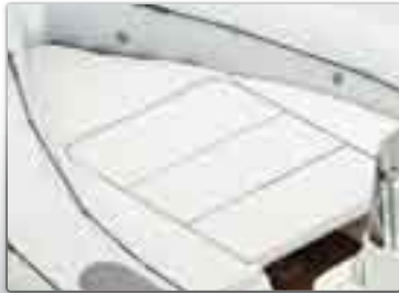
Sundeck (different models available)