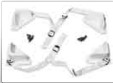
Ice chest tie down kit