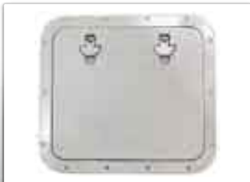
Aluminium hatch (different dimensions)