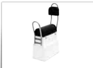
Single modular seat Dim. (cm) : L: 59 x w: 32 x h: 81