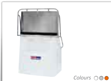
Center console PT-7 (DR range) Dim. (cm) : L: 78 x w: 100 x h: 154