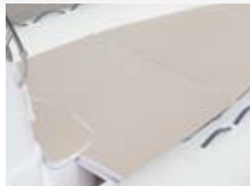
Bow extension sundeck with beige or white cushions (580/630 models)