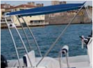
Stainless steel roll bar with navigation lights (except 685)