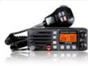
VHF DSC GX 1100 Standard Horizon