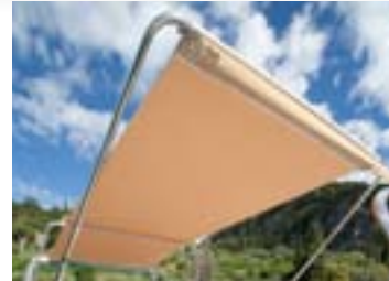
Bimini for roll Bar - blue or beige