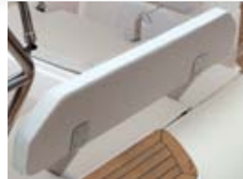
Fixed right side backrest