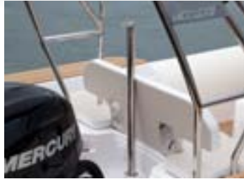
Stainless steel ski mast