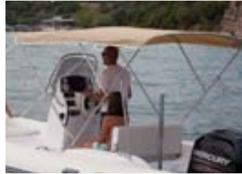
Bimini in stainless steel - blue or beige