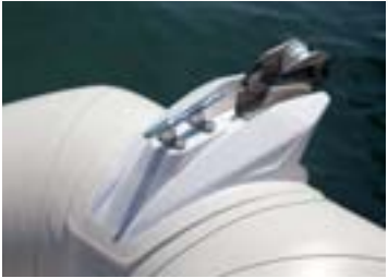
Fibreglass bow roller