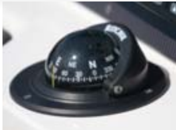
Black Compass F-50