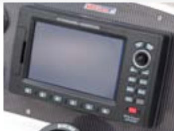
Chart Plotter - 7" Standard Horizon CP-300I or CPF-300I