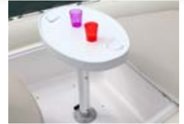
Bow kit table with support