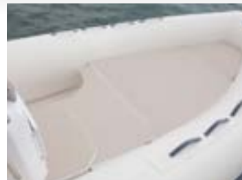
Bow extension sundeck with beige or white cushions (550/500 models)