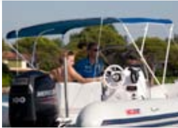
Bimini in painted aluminium - blue or beige