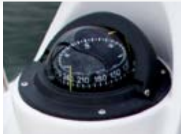
Black Compass F-83