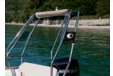
Stainless steel roll bar with navigation lights (685 model)