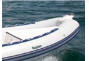
Bow sundeck cushion (Comfort models)