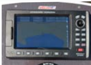
Chart Plotter - 5" Standard Horizon CP-180I or CPF-180I