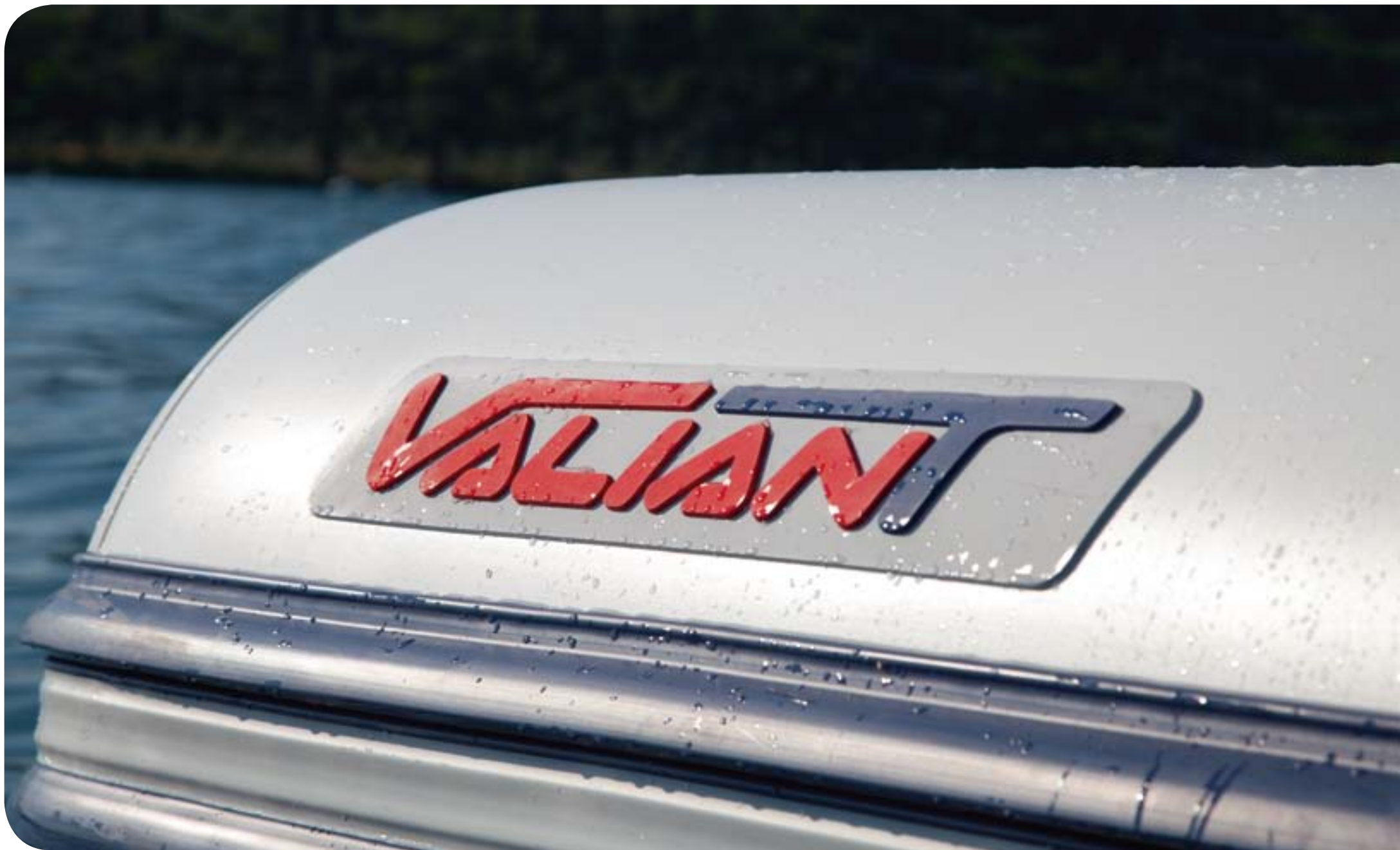
Leisure Rigid Inflatable Boats