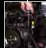
Easy Water Drain System