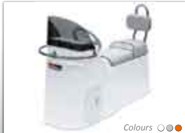
Double Jockey console S-7 with steering wheel (DR range) Dim. (cm) : L: 155 x w: 62 x h: 114