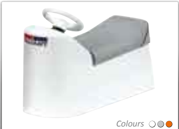
Jockey console S-3 with steering wheel (single) Dim. (cm) : L: 106 x w: 39 x h: 55

Accessories in white standard. In colour with price supplement.