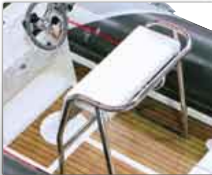
Leaning Post stainless steel, 2 persons (standard)