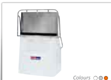
Center console PT-7 (DR range) Dim. (cm) : L: 78 x w: 100 x h: 154