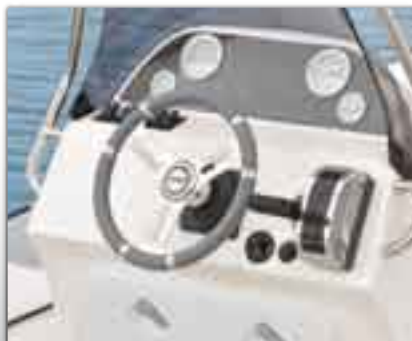
Dashboard with instrumentation