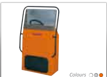
Center console PT-6 (DR range) Dim. (cm) : L: 43 x w: 77 x h: 151