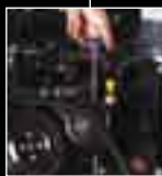
Easy Water Drain System